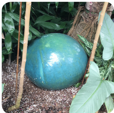
A ball like this one

Go explore! See if you can find the objects pictured below. Put an 'X' in the box as you find each object. You might find other amazing things along the way!